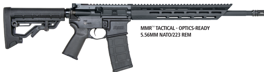
MMR™ TACTICAL - OPTICS-READY 5.56MM NATO/223 REM

6-Position stock provides 3.25" LOP adjustment by use of the integrated lever. The FLEX System recoil pad is interchangeable with 3 other thicknesses for further LOP flexibility (pads sold separately).