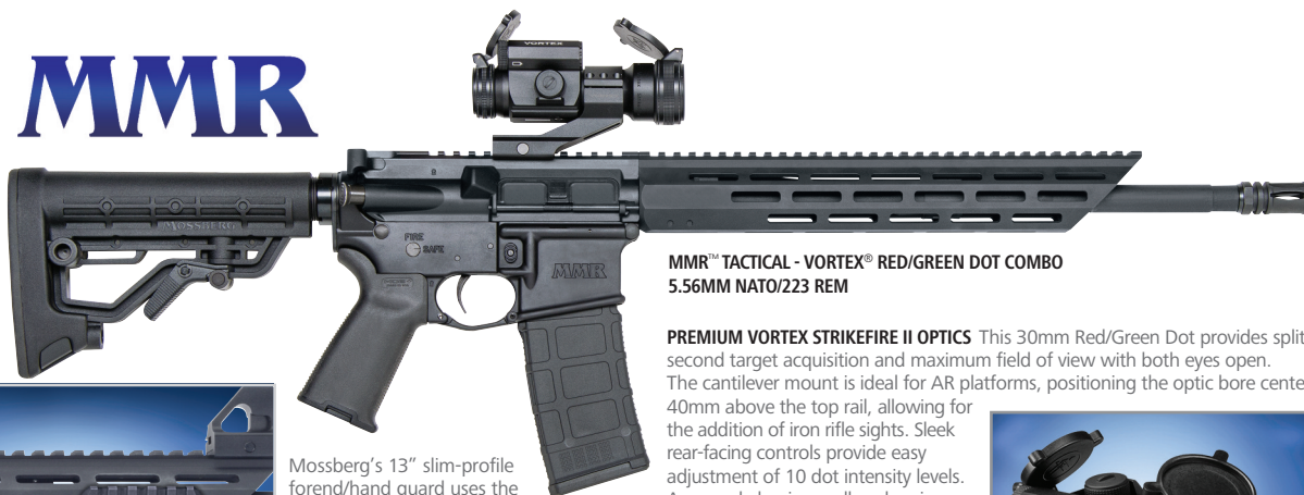
MMR™ TACTICAL - VORTEX® RED/GREEN DOT COMBO 5.56MM NATO/223 REM

PREMIUM VORTEX STRIKEFIRE II OPTICS This 30mm Red/Green Dot provides split-second target acquisition and maximum field of view with both eyes open. The cantilever mount is ideal for AR platforms, positioning the optic bore center 40mm above the top rail, allowing for the addition of iron rifle sights. Sleek rear-facing controls provide easy adjustment of 10 dot intensity levels. A rugged aluminum alloy chassis provides an extra-high recoil rating and is both waterproof and fogproof.